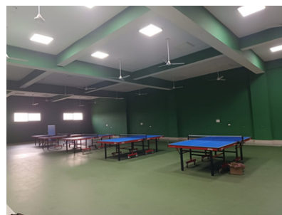
IIT (BHU), Varanasi Student Activity Center (SAC)

The Foundation maintained its fiduciary responsibility to ensure that investment returns would be sufficient to support these students for four years covering fees and medical insurance. We believe that it is important to encourage more women in STEM, especially those who are economically disadvantaged.