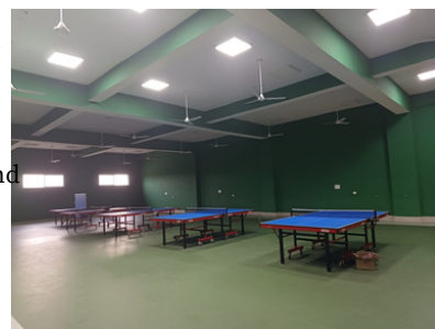
IIT (BHU), Varanasi Student Activity Center (SAC)

The Foundation maintained its fiduciary responsibility to ensure that investment returns would be sufficient to support these students for four years covering fees and medical insurance. We believe that it is important to encourage more women in STEM, especially those who are economically disadvantaged.