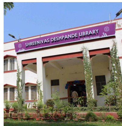
IIT (BHU), Varanasi Main Library